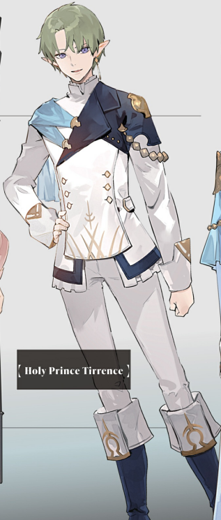
[ Holy Prince Tirrence ]