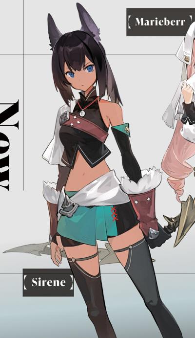
[ Sirene ]